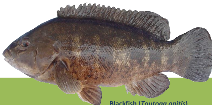
Blackfish ( Tautoga onitis )