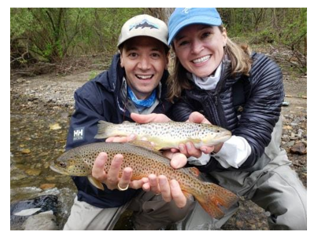
Double Trouble on the Housatonic

Housatonic River – Fishing has been good despite some challenging conditions and the river continues to clear and drop towards more comfortable levels. Reports to our Facebook page of anglers catching lots of the brown trout (the ones we stocked about a week or so ago). Flows are currently 1,660 CFS at Falls Village and 2,870 CFS. With some rain in the forecast, anglersare reminded that they can call the FirstLight Power Resources flow line at 1-888- 417-4837 for updated river information or check the <u>USGS website</u> for up to date real time streamflow data from a number of USGS gauging stations including two on the upper Housatonic River.