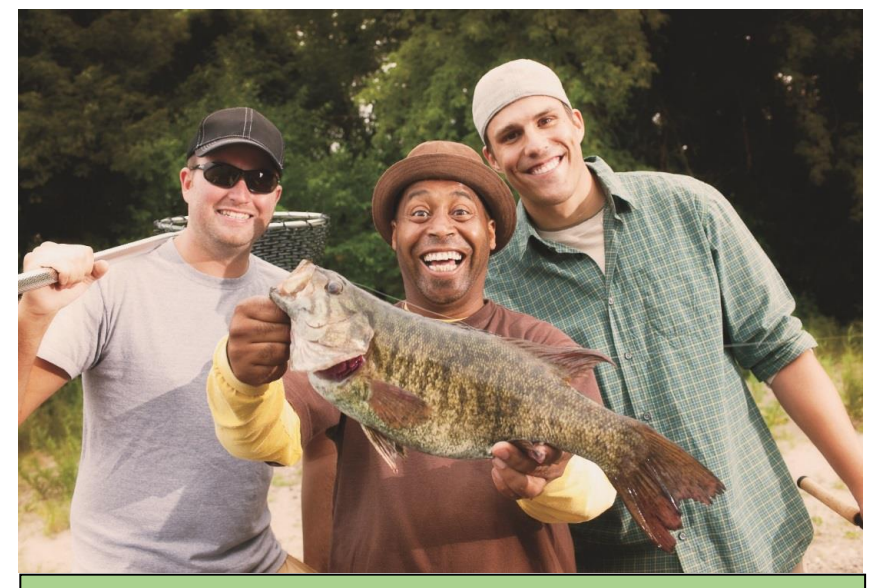
May 11 is Connecticut's annual FREE FISHING DAY where anyone can fish without needing a fishing license (or trout and salmon stamp). All other fishing rules and regulations still apply.

Farmington River – The Church Pool has been a virtual ghost town the past couple of weeks (very unusual for this time of year) as wading has been very difficult (the few working the shoreline or drift boating have been successful at landing multiple fish). However, West Branch releases have just dropped, and flows have moderated to more fishable levels, currently, 392 CFS at Riverton plus an additional 223 CFS from the Still River (where flows may increase on Friday or late Sunday into Monday depending on rainfall amounts for the two rain events forecast). Anglers will still have to work for their fish, but conditions have improved. Creativity in fishing spots remains a plus.