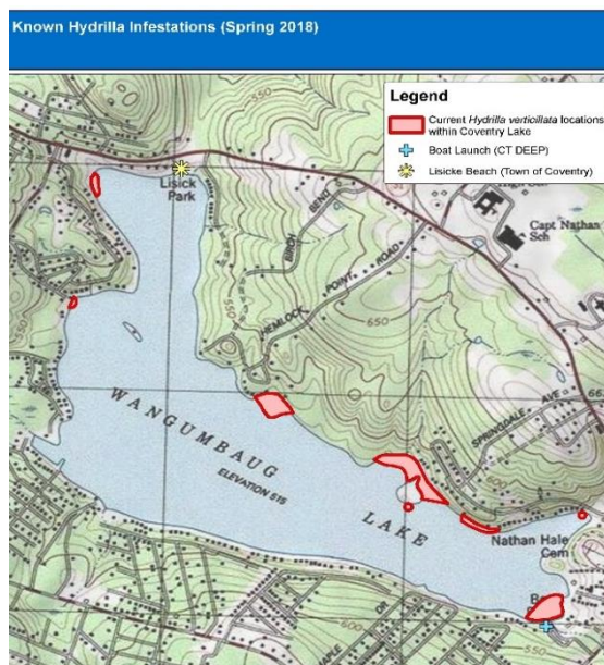
Known locations of hydrilla at Coventry Lake (Wangumbaug Lake). Boaters should avoid these areas noted with red to avoid fragmenting and spreading hydrilla.

GLASGO POND (canoe/kayak race). A canoe/kayak race event is scheduled for Sunday, June 9 th , from 9:30 am through 1:30 pm. Boaters should use extra caution during the event (the course laps both Glasgo Pond and Doanneville Pond). Although this event will be using the state boat launch on Glasgo Pond, room will be available to the general public to launch. Boaters should however use additional caution on the lake.