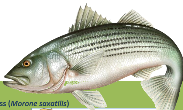
Striped Bass ( Morone saxatilis )